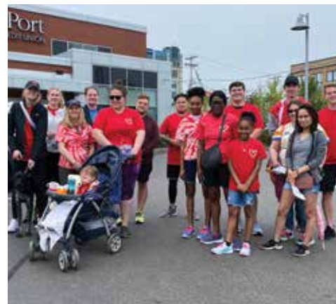
cPort families participating in American Heart Association's 2022 Heart Walk.