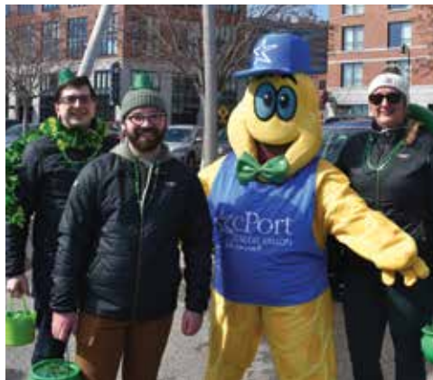
cPort staff participating in Portland's St. Patrick's Day Parade