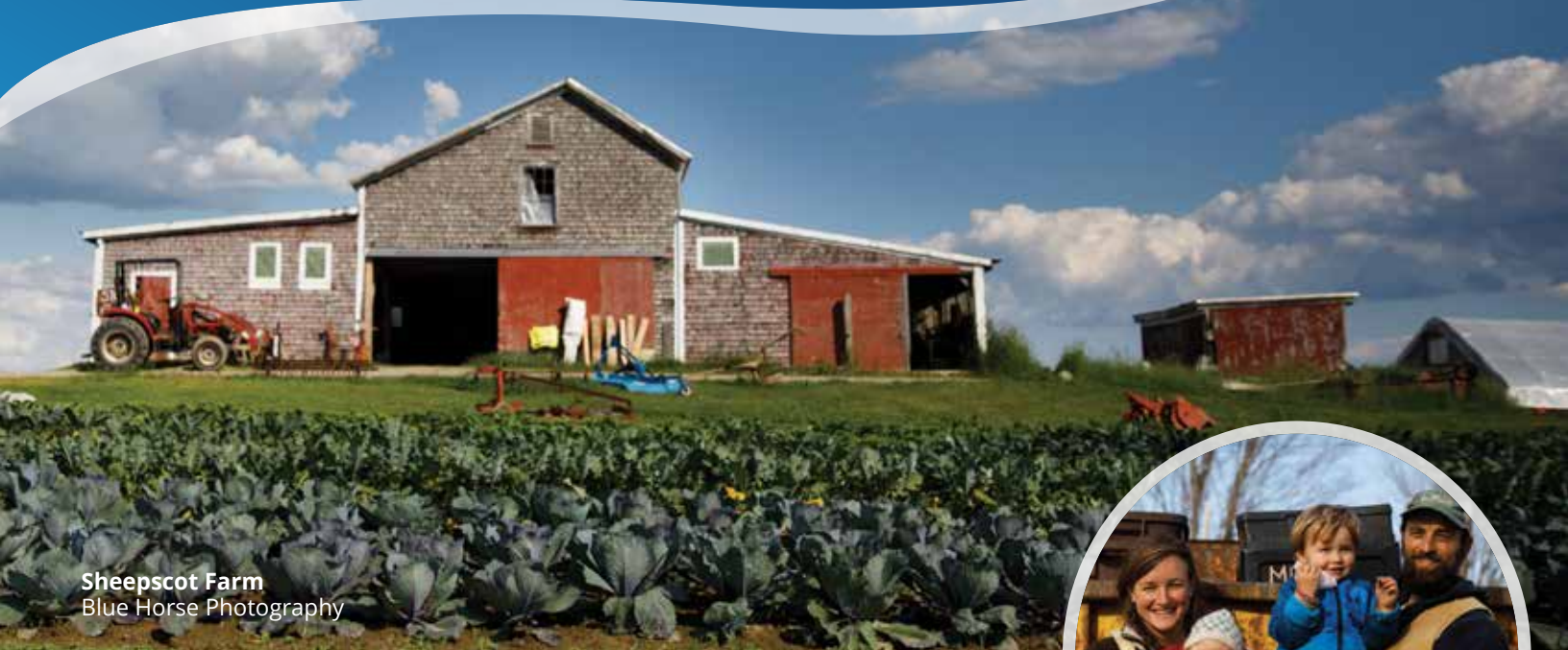
Sheepscot Farm Blue Horse Photography