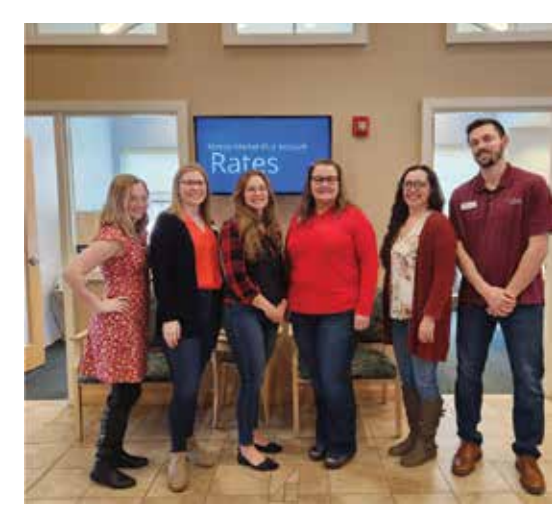
cPort employees are proud to support The American Heart Association Maine as our branches dressed in red in February to help raise awareness for heart disease in women.