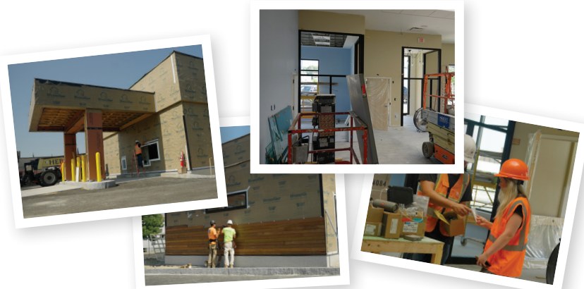
cPort's Lewiston branch under construction in August.

Their hard work has transformed our ideas into a beautiful and functional branch that truly reflects our values and aspirations. As we prepare to open our doors, we are filled with gratitude for everyone who played a role in this journey, and we cannot wait to begin serving our members in Lewiston. Be on the lookout for our official cPort Lewiston branch opening date—coming soon to your email, social media, and our website.