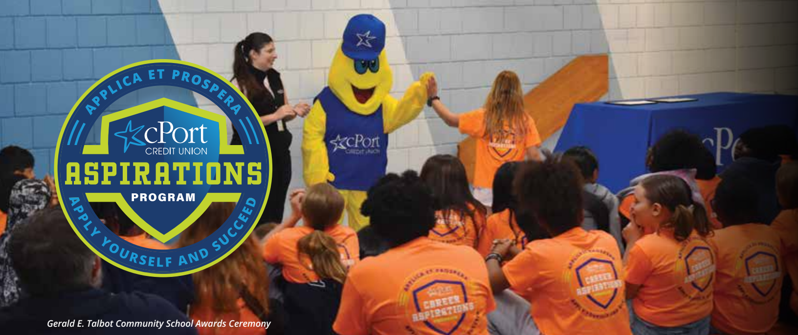
Gerald E. Talbot Community School Awards Ceremony